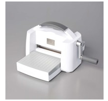
Stampin' Cut & Emboss