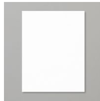
Basic White 8 1/2" X 11"