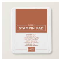
Copper Clay Classic Stampin'