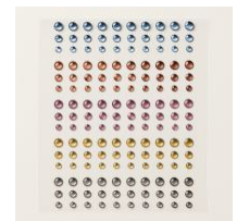
2023-2025 In Color™ Dots