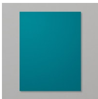
Pretty Peacock 8-1/2" X 11"