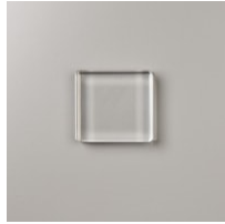
Clear Block D