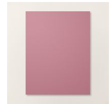
Moody Mauve 8 1/2" X 11"