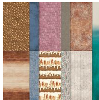
Earthen Elegance 12" X 12"