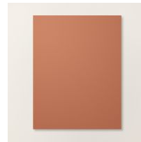
Copper Clay 8 1/2" X 11"