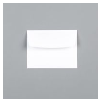
Basic White Medium