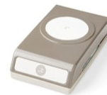
2" (5.1 Cm) Circle Punch