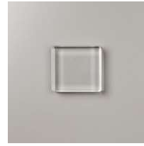
Clear Block D [I18485] $9.50