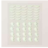
Glow In The Dark Bats & Ghosts [I62220] $8.00