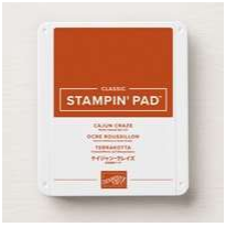
Cajun Craze Classic Stampin' Pad [I47085] $9.00