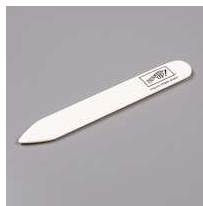
Bone Folder [I02300] $7.00