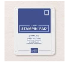
Starry Sky Classic Stampin' Pad [I59212] $9.00