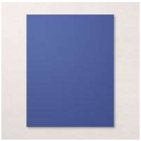
Starry Sky 8 1/2" X 11" Cardstock [I59263] $10.00