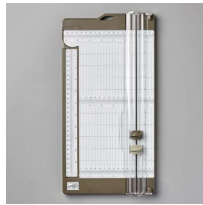
Paper Trimmer [I52392] $26.00