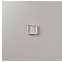
Clear Block A [I18487] $5.00