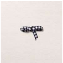
Black & White 1/4" (6.4 Mm) Gingham Ribbon [I56485] $7.00