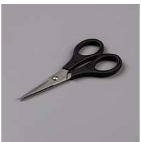
Paper Snips [I03579] $11.00