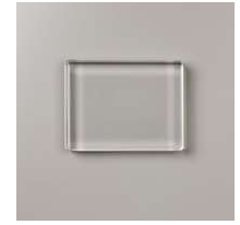
Clear Block E [I18484] $13.00