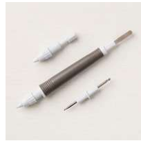
Take Your Pick [I44107] $11.00