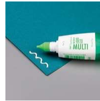
Multipurpose Liquid Glue [I10755] $5.50