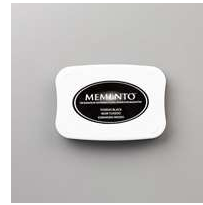
Tuxedo Black Memento Ink Pad [I32708] $6.50