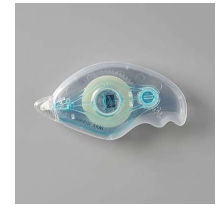
Stampin' Seal [I52813] $8.00