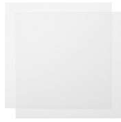
Window Sheets [I42314] $5.00