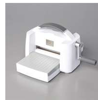
Stampin' Cut & Emboss Machine [I49653] $128.00