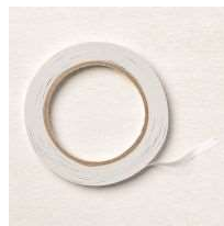
Tear & Tape Adhesive [I54031] $7.00